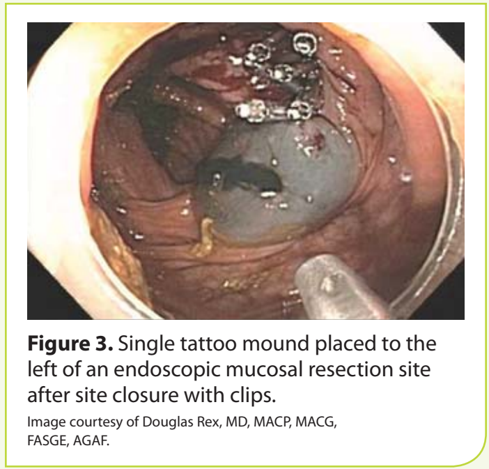
Figure 3. Single tattoo mound placed to the left of an endoscopic mucosal resection site after site closure with clips.

the remaining submucosal injection mound, and note the location in the report (eg, “with the lesion down the tattoo is to the left”). When marking for surgery, the full circumference of the bowel should be marked. The location of the tattoo (eg, “a circumferential tattoo is placed 3 cm distal to the cancer”) should be noted. The endoscopist should be cautious about naming a segment with nonspecific endoscopic landmarks (eg, “the tumor is in the descending colon”).